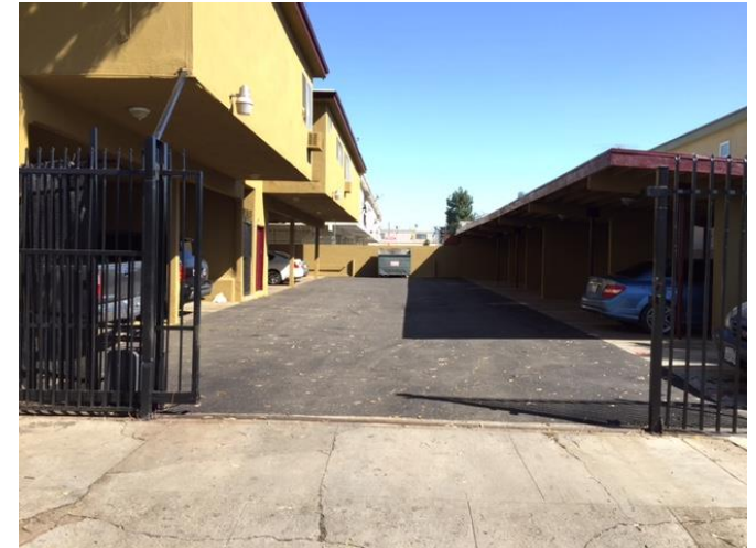
Covered Parking in Rear of Building