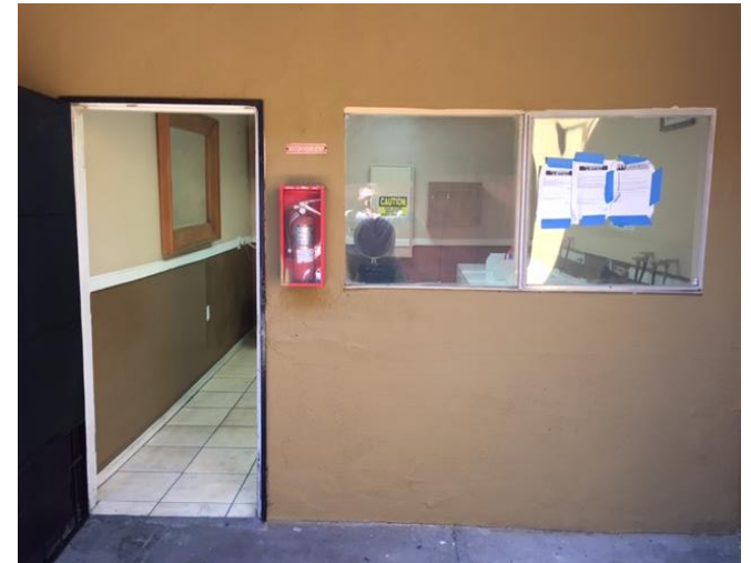
On-Site Laundry Room