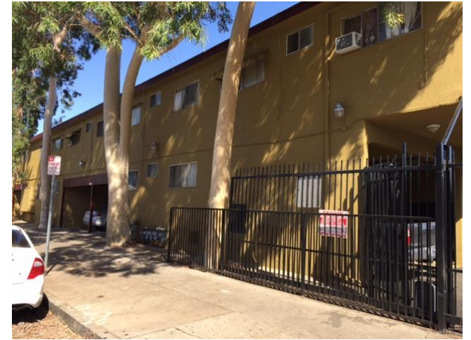
Side View of Building with Covered Parking